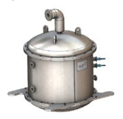
NCF's Reaction Unit

NCF reaction units are the core component of the product, but additional peripheral systems are required as well for installation in industrial plants. Appropriate interfaces and specific performance adaptations are essential for optimizing the overall system performance, technologically as well as economically. The NCF team is currently accelerating the discussions with suppliers of peripheral systems such as {\rm CO_2} capture, gas conditioning, power generation blocks and high temperature heat exchangers. Simultaneously, NCF continues to review additional markets as they have been approached by various corporations who see the environmental and economic benefits provided by the NCF technology. Some of these industries / markets include gas to liquid (GTL), waste gasification and the chemical market. These efforts are aimed to deepen the knowledge about the added value in each industry and broaden the business opportunities for NCF's product.