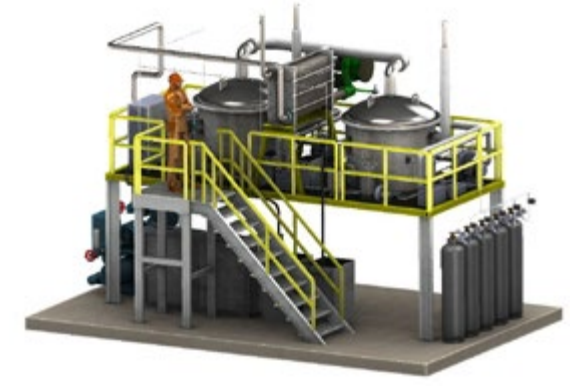
NCF's Test Facility